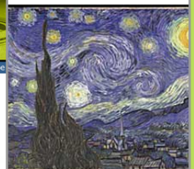
an Gogh's Starry Night , painted in an insane asylum, accurately models a mystery of physics.